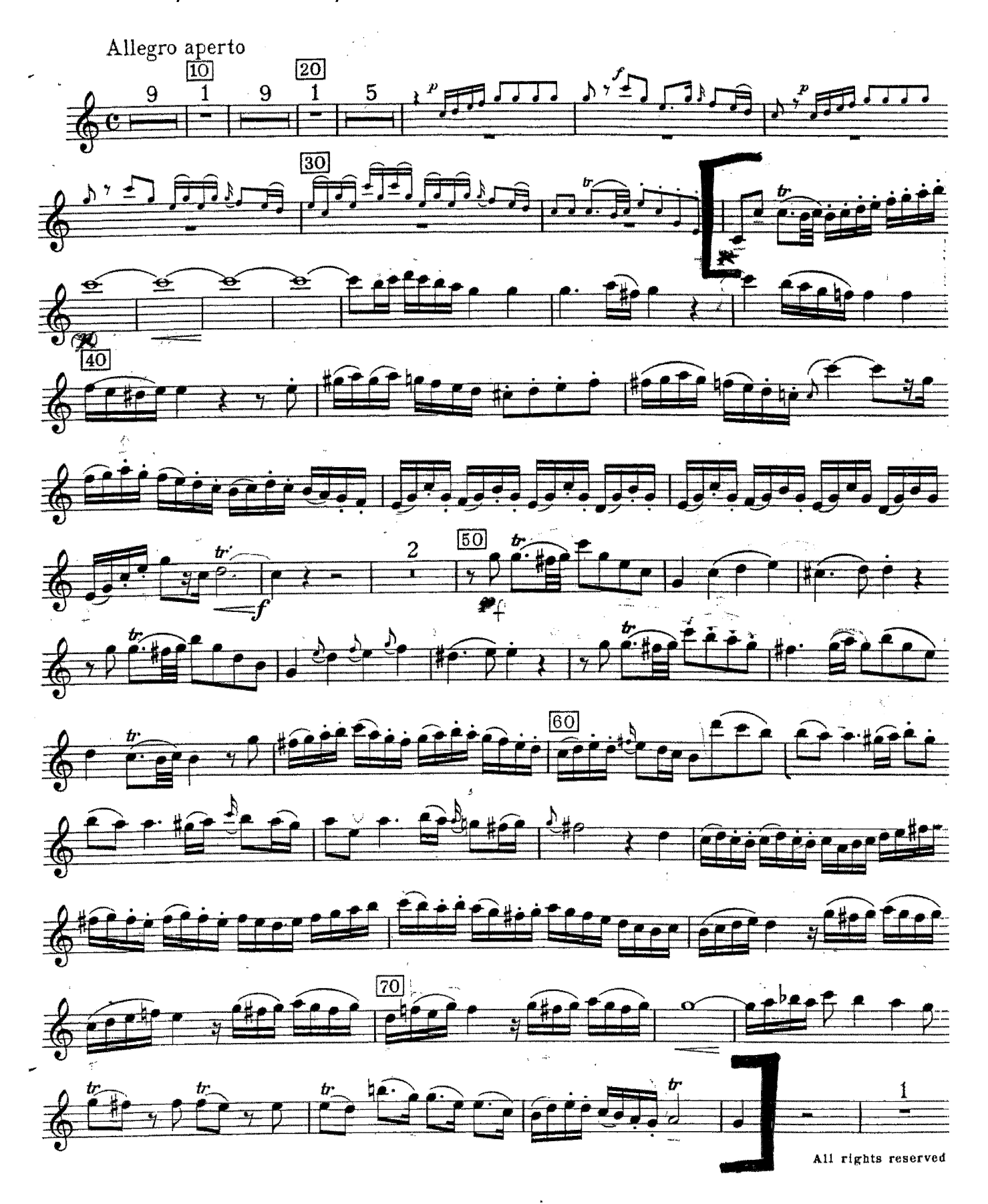
Oboe I: Mozart, Oboe Concerto, mm. 32-76